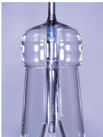
Figure 1: UV-cured adhesive bonding needle to syringe.

Syringes first emerged many years ago, in the times of medieval Arabia and the Byzantine Empire, roughly around 1000 AD. The devices continued to evolve but it was not until 1843 that British surgical instrument maker, Daniel Ferguson, received a patent for his “elegant little syringe” with a hand-made hollow needle that was screwed into a glass body of the device. 1